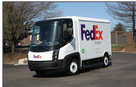
PHEV and EV Commercial Vehicles