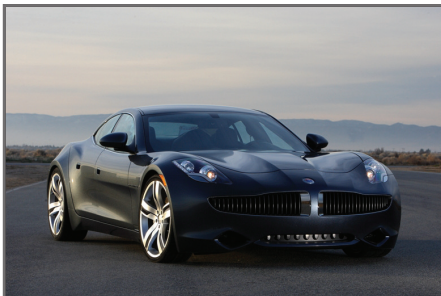
PHEV and EV Passenger Vehicles