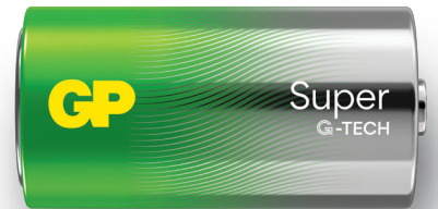
Model No.: GP14A

This specification is applicable to GP Alkaline Cell, GP14A Super (Mercury & Cadmium Free).