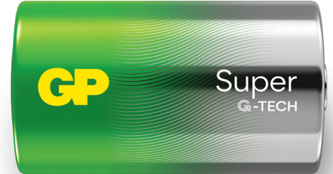
Model No.: GP13A

This specification is applicable to GP Alkaline Cell, GP13A Super (Mercury & Cadmium Free).