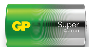
Model No.: GP13A

Requirement: No visible leakage; No explosion.