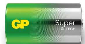
Model No.: GP13A

Requirement : No fire or explosion; Leakage is allowable.